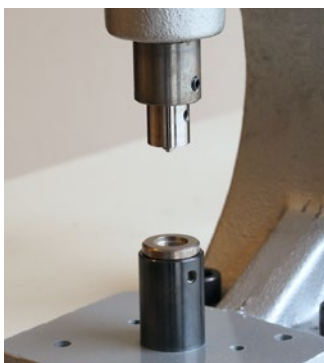
For Cap & Socket