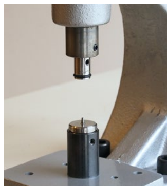
For Stud & Post

We also accept orders for Press dies. Using dies that are appropriate for each product reduces installation errors and ensures a clean finish. Please feel free to consult with us when ordering.